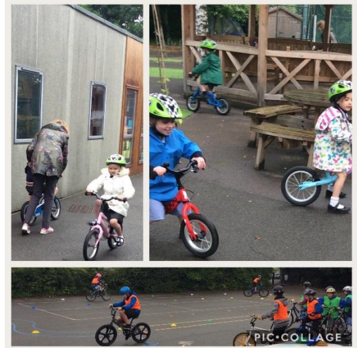
Learning to ride bikes.

The MUGA is fantastic for PE lessons, playtimes and clubs