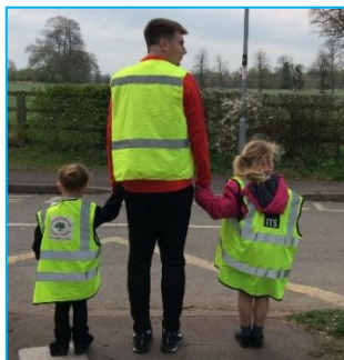
Year 1 road safety training