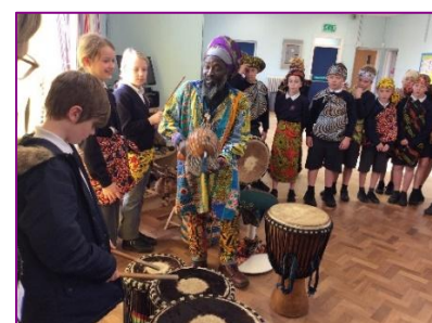
African music workshop