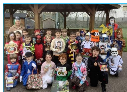
World book day