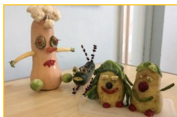
Entry for Harvest competition