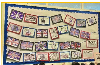
Jubilee art work