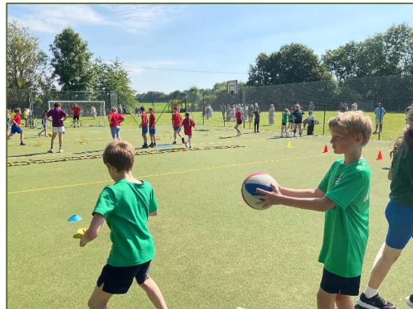
Sports day warm up and stations