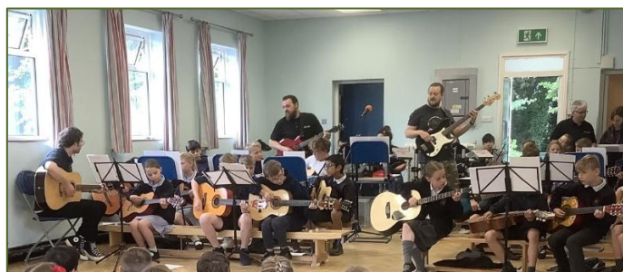
Jam Music Concert