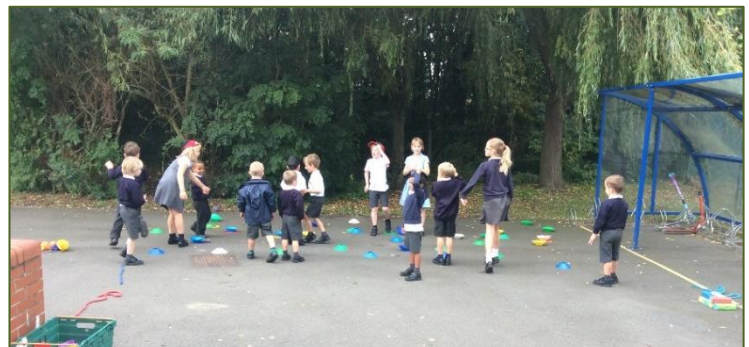
Y5 young leaders organising games

I was quite nervous about the cricket because I had never played cricket before, but it was fun.