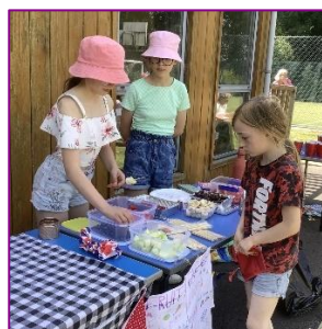
Young Enterprise afternoon