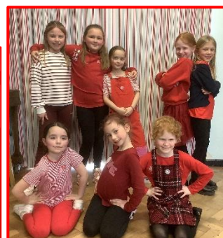
Red Nose day talent show