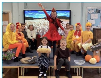
Year 3 & Y4 production