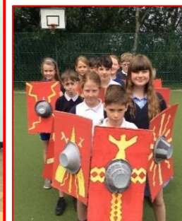
Romans have arrived