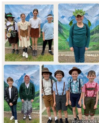
Year 6 Summer production