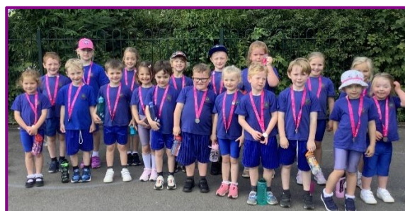
Race for Life