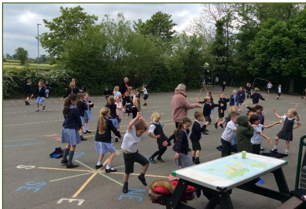
Active lunchtimes- dancing on the playground.