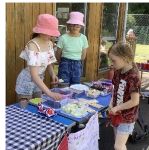
Young Enterprise afternoon