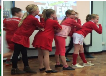
Red Nose day talent show