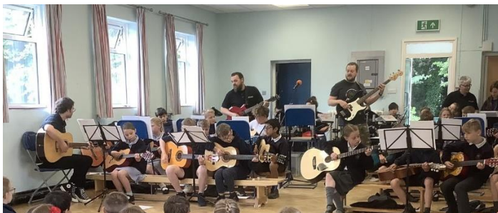
Jam Music Concert