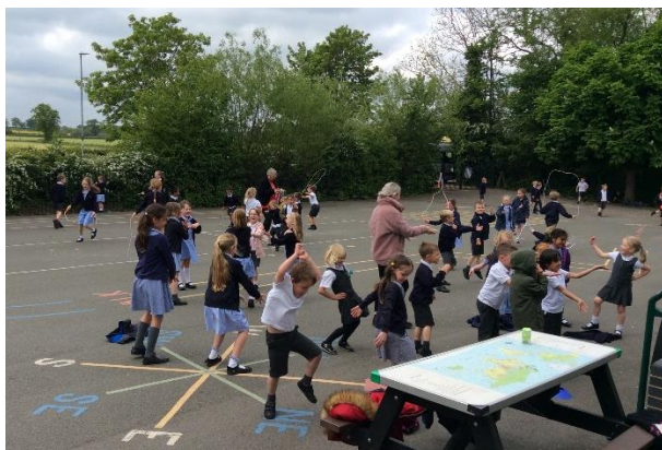
Active lunchtimes- dancing on the playground.