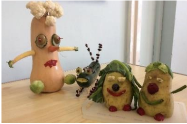
Entry for Harvest competition