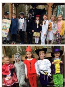
World book day