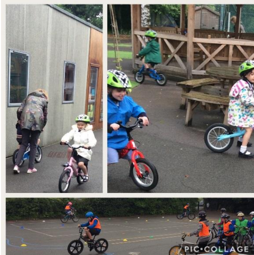
Learning to ride bikes.