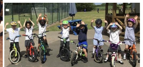
EYFS Pedal Award