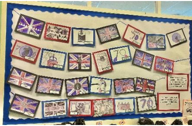
Jubilee art work