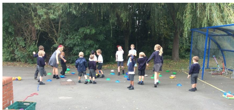
Y5 young leaders organising games

I was quite nervous about the cricket because I had never played cricket before, but it was fun.