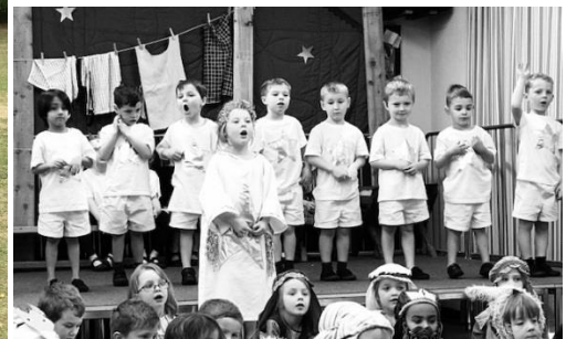
Keystage 1 christmas production