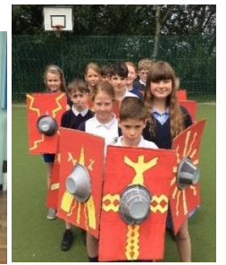
Romans have arrived