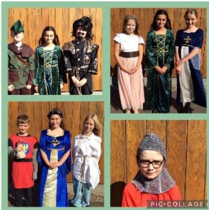
Year 6 Summer production