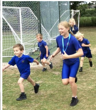
Race for Life