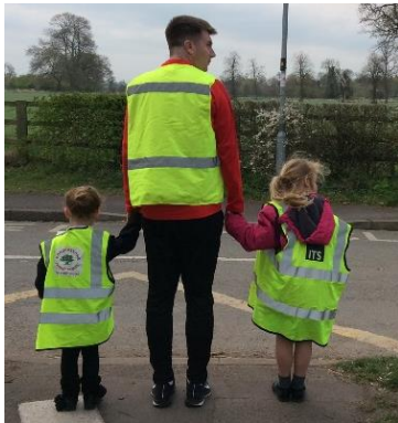
Year 1 road safety training