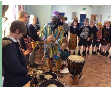
African music workshop